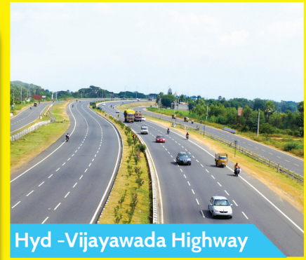
Hyd -Vijayawada Highway