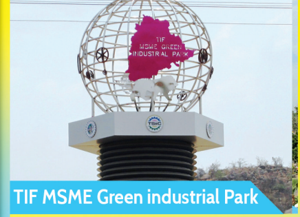
TIF MSME Green industrial Park